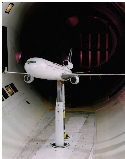
Figure 5.8 NASA researchers test a model plane in a wind tunnel.

The value of the drag coefficient, C , is determined empirically, usually with the use of a wind tunnel. (See Figure 5.8 ).