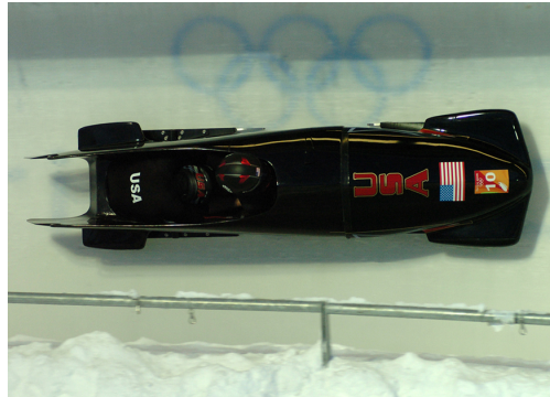
Figure 5.7 From racing cars to bobsled racers, aerodynamic shaping is crucial to achieving top speeds. Bobsleds are designed for speed. They are shaped like a bullet with tapered fins.

Athletes as well as car designers seek to reduce the drag force to lower their race times. (See Figure 5.7 ). “Aerodynamic” shaping of an automobile can reduce the drag force and so increase a car’s gas mileage.