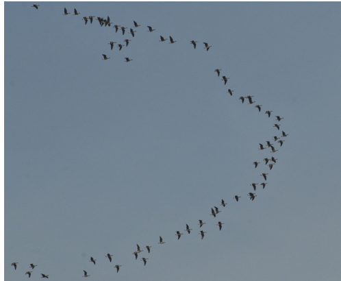
Figure 5.10 Geese fly in a V formation during their long migratory travels. This shape reduces drag and energy consumption for individual birds, and also allows them a better way to communicate.

If we compare animals living on land with those in water, you can see how drag has influenced evolution. Fishes, dolphins, and even massive whales are streamlined in shape to reduce drag forces. Birds are streamlined and migratory species that fly large distances often have particular features such as long necks. Flocks of birds fly in the shape of a spear head as the flock forms a streamlined pattern (see Figure 5.10 ). In humans, one important example of streamlining is the shape of sperm, which need to be efficient in their use of energy.