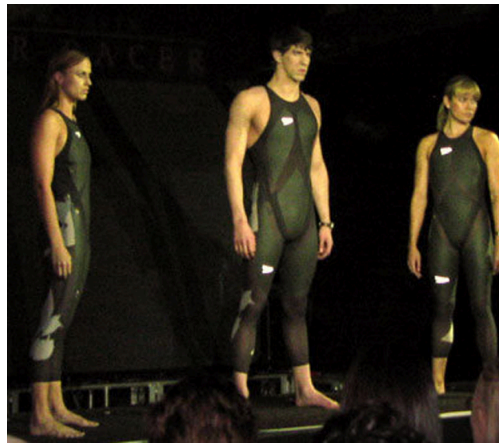
Figure 5.9 Body suits, such as this LZR Racer Suit, have been credited with many world records after their release in 2008. Smoother “skin” and more compression forces on a swimmer’s body provide at least 10% less drag.

Some interesting situations connected to Newton’s second law occur when considering the effects of drag forces upon a moving object. For instance, consider a skydiver falling through air under the influence of gravity. The two forces acting on him are the force of gravity and the drag force (ignoring the buoyant force). The downward force of gravity remains constant regardless of the velocity at which the person is moving. However, as the person’s velocity increases, the magnitude of the drag force increases until the magnitude of the drag force is equal to the gravitational force, thus producing a net force of zero. A zero net force means that there is no acceleration, as given by Newton’s second law. At this point, the person’s velocity remains constant and we say that the person has reached his terminal velocity ( v_t ). Since F_D is proportional to the speed, a heavier skydiver must go faster for F_D to equal his weight. Let’s see how this works out more quantitatively.